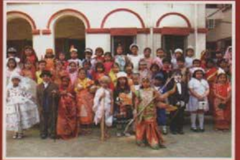
Go As You Like